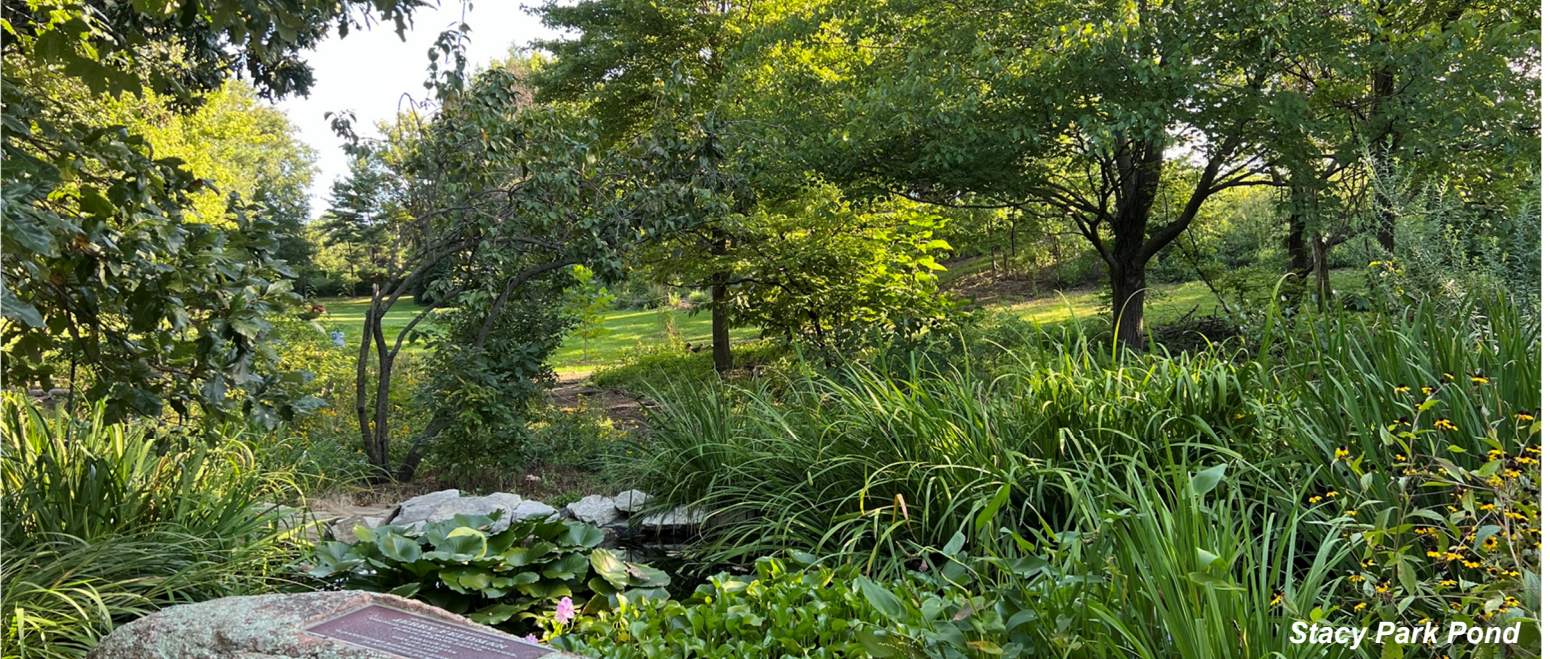
Stacy Park Pond